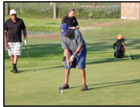
Moreno Valley Golf Club Member Putting