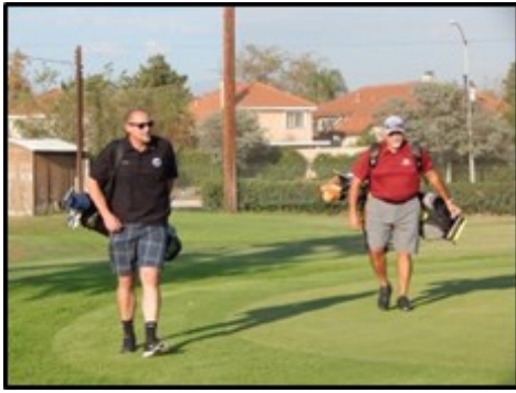
City Team Golfers