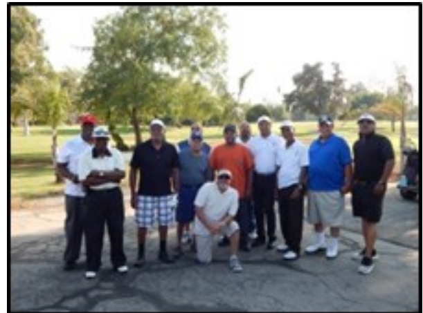
Moreno Valley Golf Club