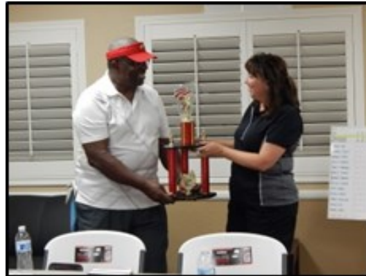
City Manager Presenting Trophy to the Moreno Valley Golf Club