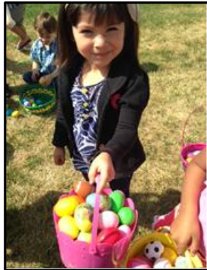
Time for Tots Egg Hunt