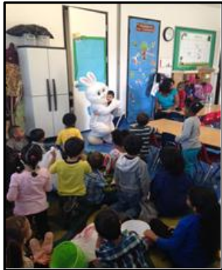
Peter Cottontail's Visit

On April 17, the annual Spring Celebration was held, which included an egg hunt, carnival games, and potluck. Peter Cottontail was also in attendance.