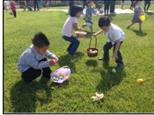
Time for Tots Egg Hunt

Staff is planning the end of the year Time for Tots activities and June 4 graduation ceremony. Staff is currently preparing the curriculum for the summer sessions, which begin June 16.